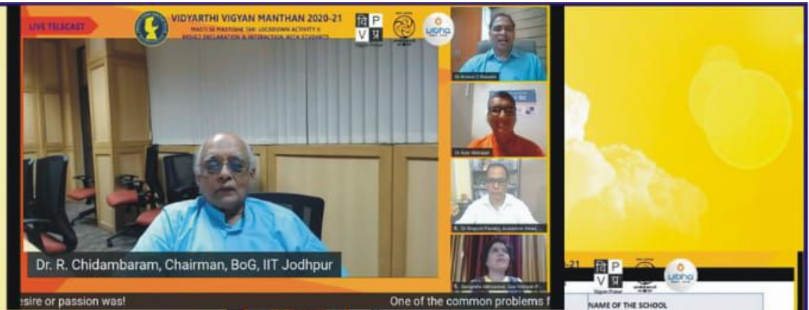
...sire or passion was