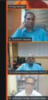
One of the common problems f